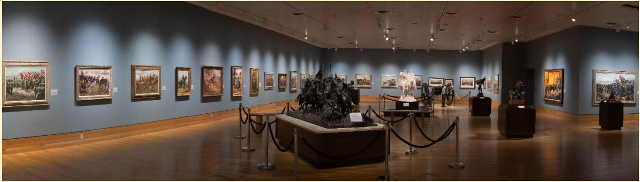
Panorama from the door leading into the War is Hell gallery