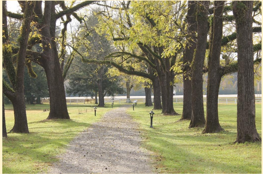
A shot along the old carriage path by Erika Verde.