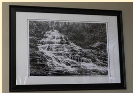
White Mat Board

accordingly, most buyers will want to re-frame the image to meet there needs.