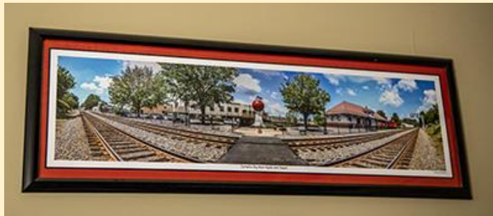
Virtual Double Mat Created in Photoshop

Frames and mat boards are available at Hobby Lobby for reasonable prices. They also have kits to cut the mat boards with or they can cut them for you. They can also do custom framing.