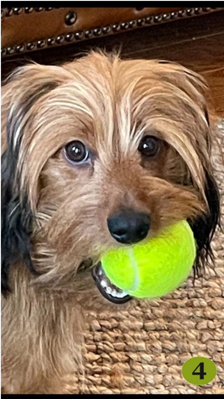
COVER PHOTO: MARSHA TIESLER, WINNER OF THE MONTHLY (OCTOBER) FOOTHILLS CONTEST.