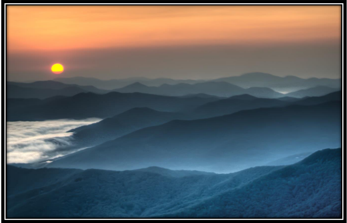
Brasstown Bald - Highest Point in Georgia

Description: You can see forever from the summit (on a clear day) but even if you couldn't it's a really nice place to visit. It is the highest point in Georgia at 4,784 feet above sea level. The visitor center (located at the summit) is very nicely done. The exhibits give a glimpse into the natural and human history of the Southern Appalachians - including the Cherokee Indians that lived in this area. During the hours the visitor center is open (10 AM to 5 PM daily) there is a shuttle from the parking lot to the top.