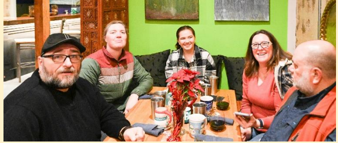
Attendees waiting for the (excellent) meal.