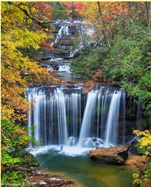
The shows two of the four falls.

Brasstown Falls (not the mountain) is just over the South Carolina border and is often described...”Wow, I didn’t know this was here!” or “This is a hidden gem!”.