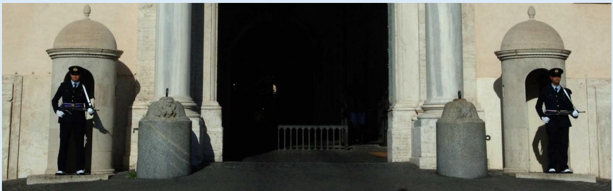
Photo: TWO guards at Buckingham Palace.