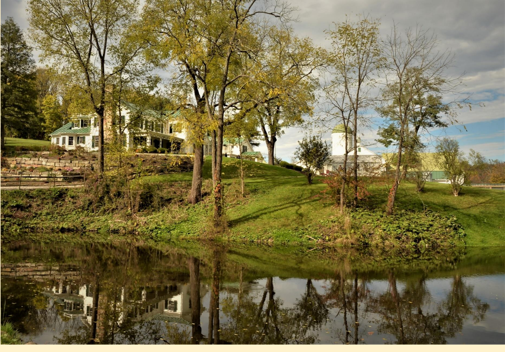
The Big House – Ohio