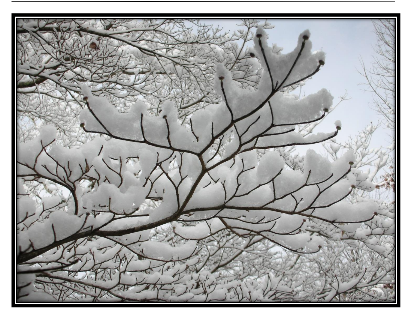
Cover Photo provided by Amelia Chatham