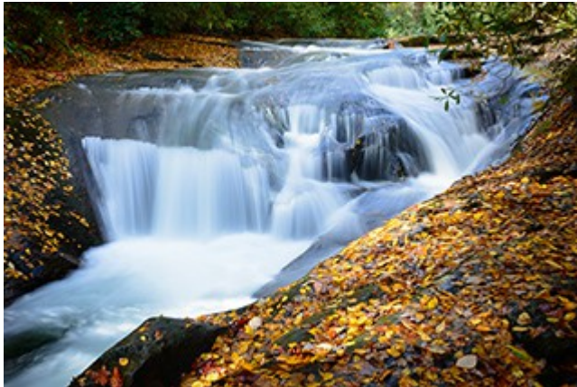
Cascades along the trail

From Helen drive north on State 75. At Robertstown (about one mile) turn right on State 356. Drive eleven miles through Unicoi State Park, etc., and make a left onto State 197. At 7.7 miles turn left onto Andersonville Lane. It's a single lane gravel roadway. Drive one-half mile to the parking area at the end of the roadway.