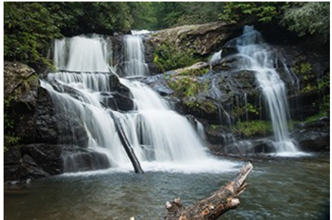
The Upper Fall

GPS of the parking area: 34°50'50.9"N 83°35'48.1"W